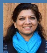
Rep Padma Kuppa