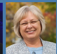
Sen Rosemary Bayer